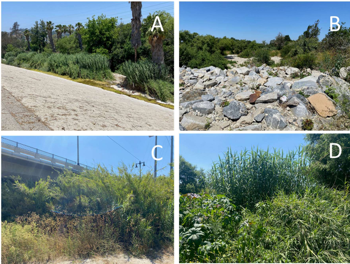
Figure 2. Representative giant cane infestations within the SPL AOR A) Los Angeles River at Glendale Narrows, B) Whittier Narrows, C) Santa Ana River, D) Rio Hondo.

sustaining management tool for giant cane in California, but a lack of information about whether agents could be used under the conditions present in project areas has prevented its widespread implementation.