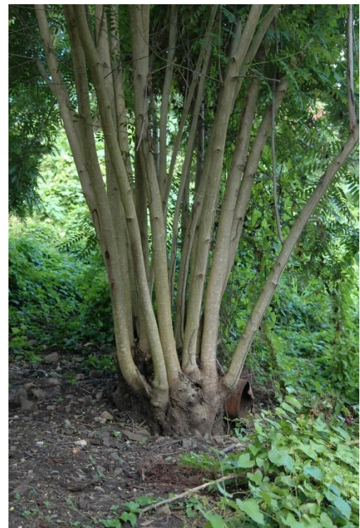
Figure 3. Coppice from live stump

Low demand on labor. The methods that Haiti's smallholder farmers use to cultivate woodfuel (described above) require low maintenance and little labor, less than for crop cultivation. This is particularly important for the many households whose younger members have migrated out of rural areas.